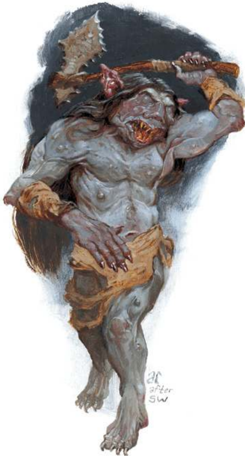
Visual Aid. Grimlock (Area L5 to L10).