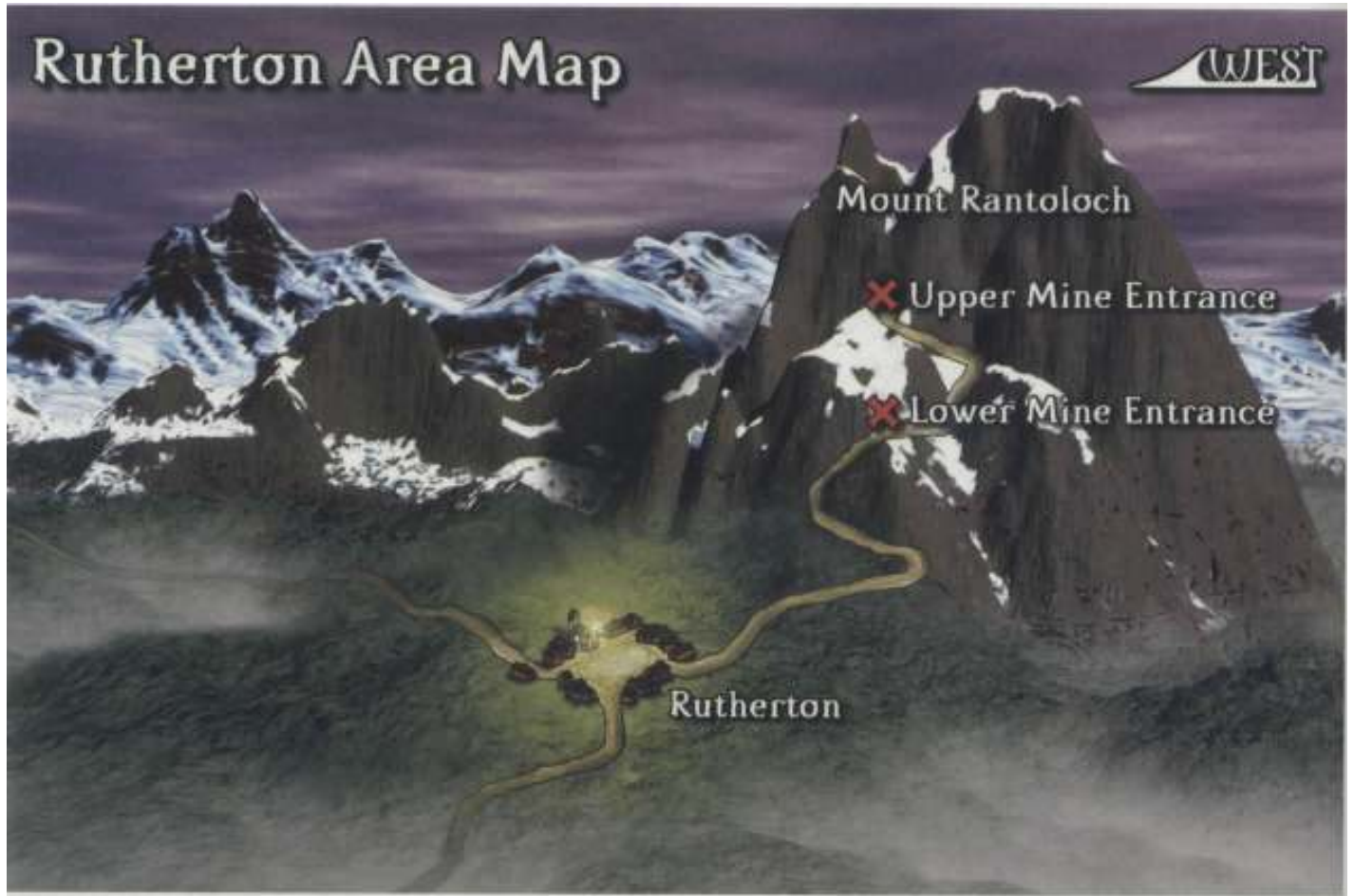
Rutherton Area Map.