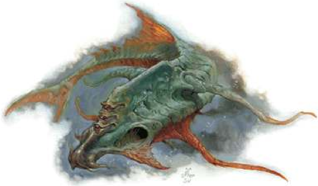
Visual Aid. Aboleth (Area L15).