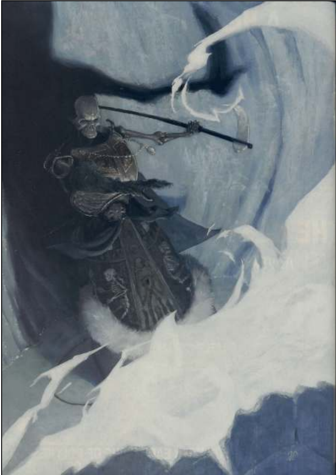
Visual Aid #1. Vargin the Lich.