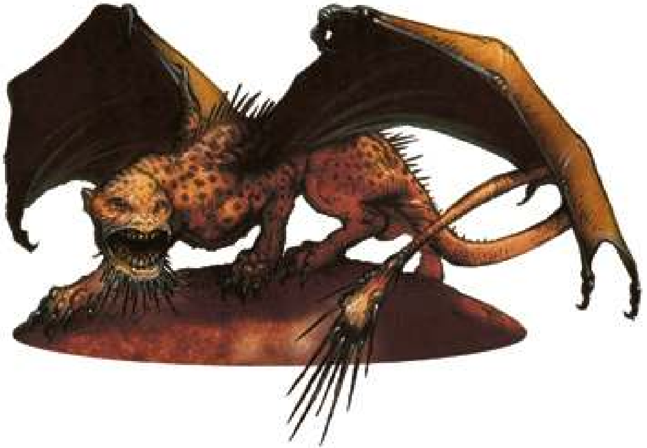
Visual Aid. Manticore (Area U7).