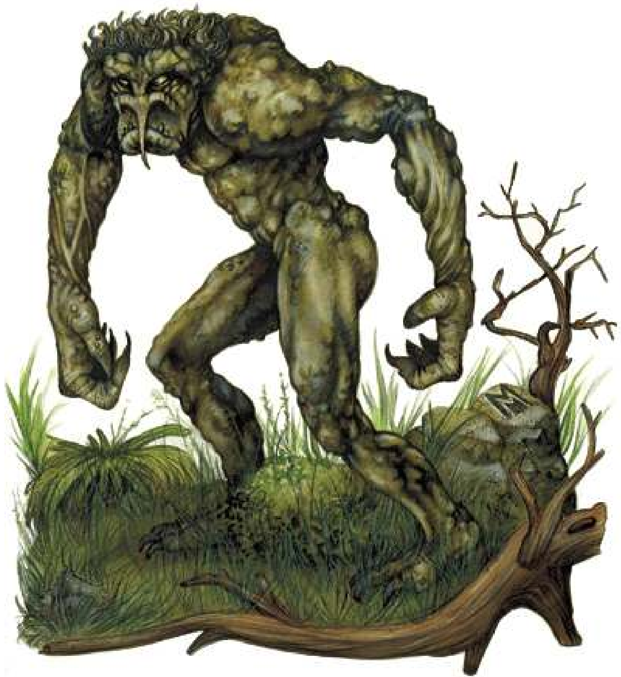
Visual Aid. Horance (Area L11).